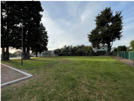
Muzzio Park garden location

The Muzzio Park Community Garden will enhance access to fresh and nutritious food, promote increased physical activity, and contribute to overall well-being in the low-income neighborhood.